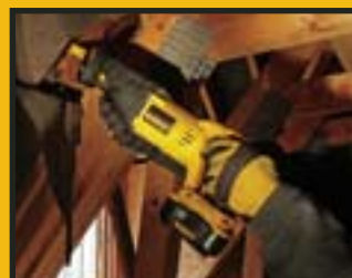
DC385KL RECIP SAW