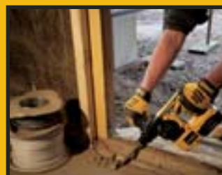
DC213KL 3 MODE SDS HAMMER