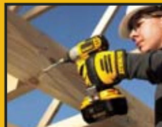
DC827KL IMPACT DRIVER