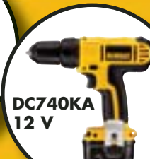
DC740KA 12 V